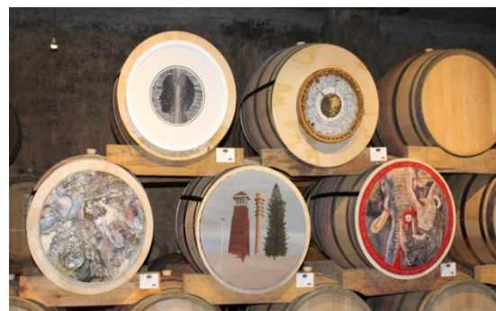
The 2015 winners

This is a national competition and postal entries are accepted. Closing date for entries is 20 May 2016.